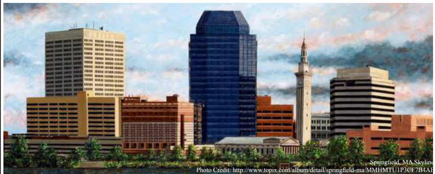
Springfield, MA Skyline