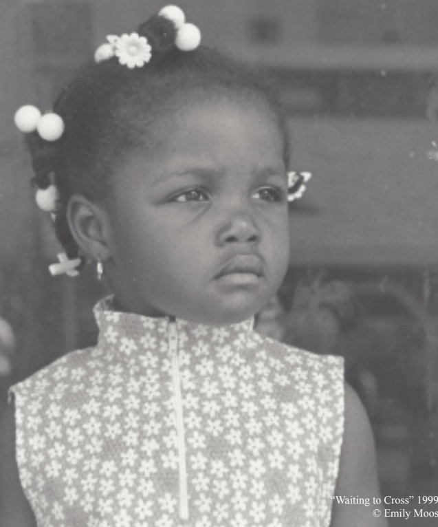
"Waiting to Cross" 1999

As one of only 45 regions nationwide to receive a 2010 Sustainable Communities Regional Planning Grant from the U.S. Department of Housing and Urban Development, the Hartford/Springfield bi-state region will roll out an ambitious work plan over the next three years to position itself as a leader in sustainable community development and a creator of more livable communities for all of the corridor's 1.6 million residents. The $4.2 million award will be used to create a foundation of opportunity—in housing, education, transportation, employment, nutrition, and community resources.