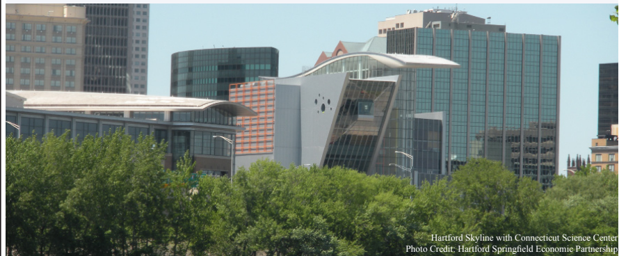
Hartford Skyline with Connecticut Science Center