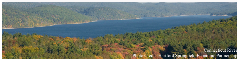
Connecticut River

Creating a detailed master planned design district to foster the development of a vibrant, mixed use, mixed income community and a healthy, safe and walkable urban neighborhood that bridges the downtown to abutting neighborhoods.